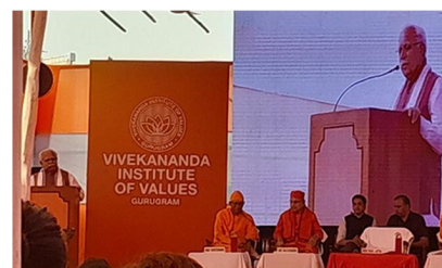
Until the creative work of man-making which Ramakrishna Mission has undertaken is followed enthusiastically by all, the country cannot progress quickly